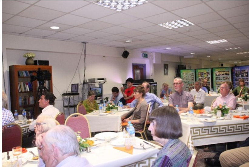
Supporters at a social event at the centre