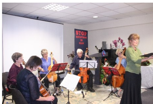
Musical interlude during a social event held at the centre

These events allow their supporters to meet the volunteers and hear first hand the progress the charities are making. These events can be for public awareness, cultural, musical or any activities for the benefit of the user charities or non-profit organizations.